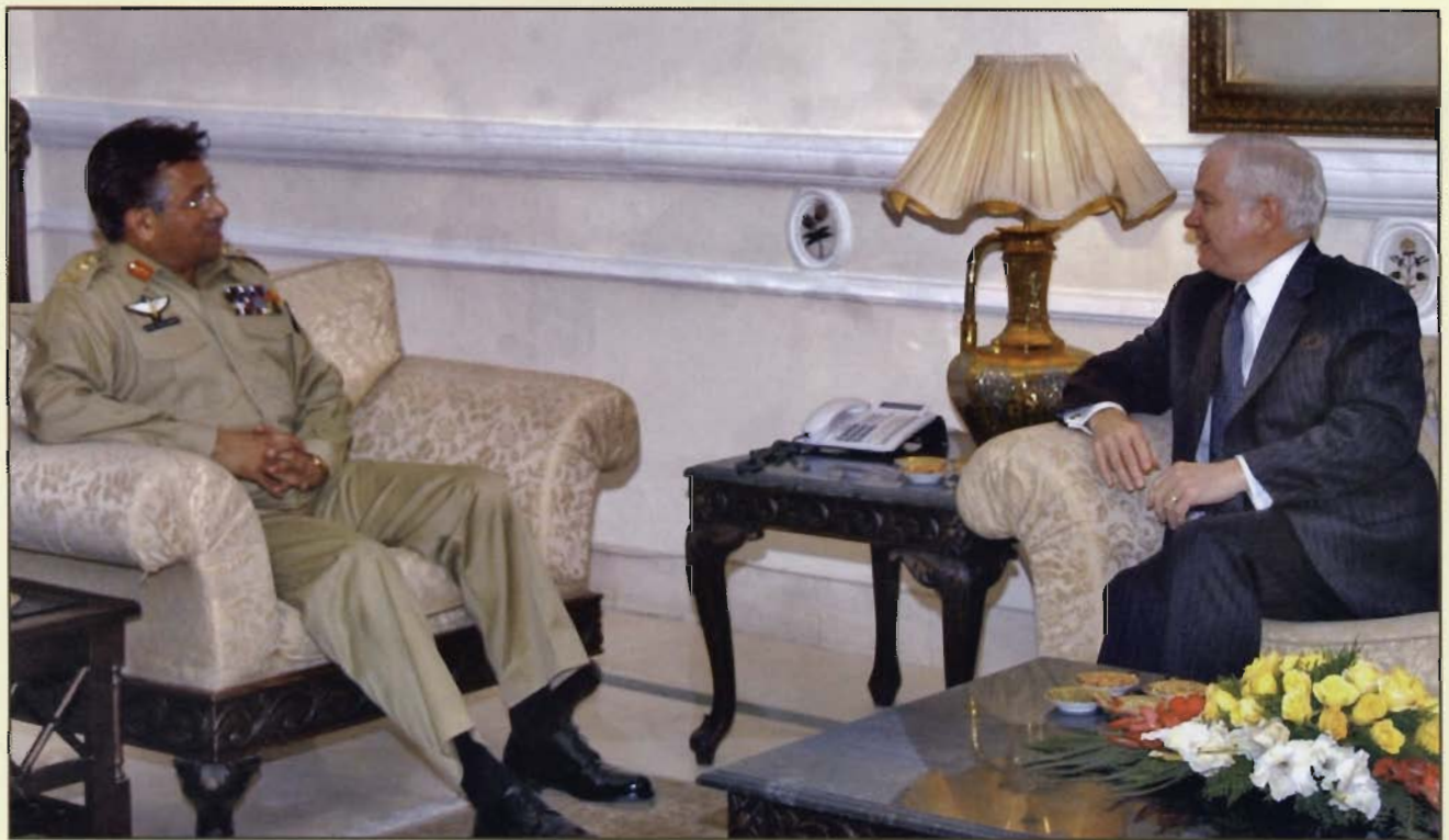
President General Pervez Musharraf talking with US Defense Secretary Robert Gates in Rawalpindi on February 12, 2007