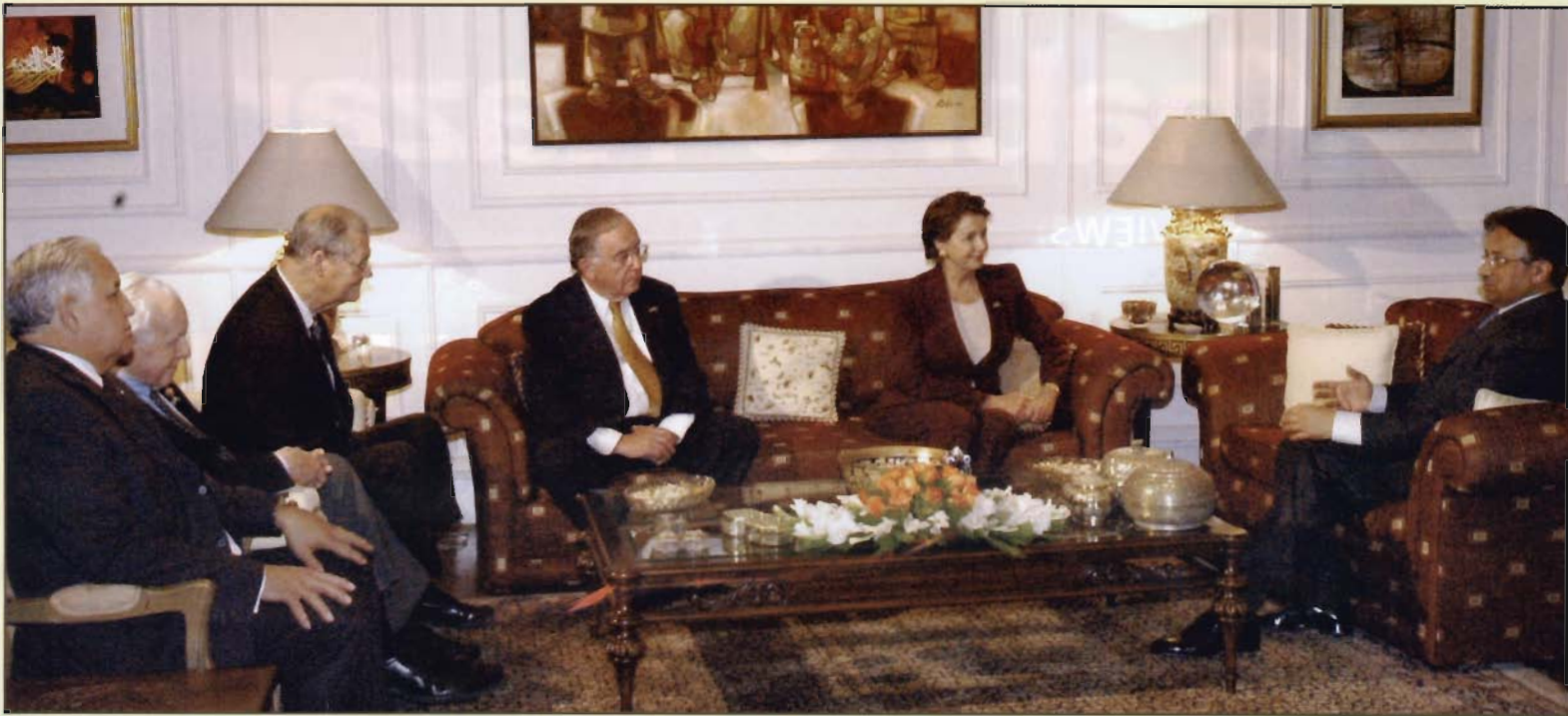
A US Congressional delegation led by Speaker Ms. Nancy Pelosi called on President General Pervez Musharraf in Rawalpindi on Saturday January 27, 2007