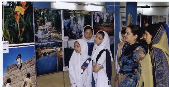
Students and other visitors at Sir Syed Memorial Hall view winning photographs captured by students for the nationwide "Earth, My Home" photography contest to observe Earth Day.