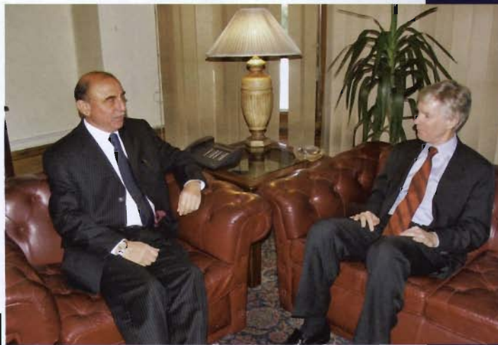
U.S. Ambassador Ryan C. Crocker meeting with the NWFP Governor, Mohammad Ali Jan Orakzai, in Peshawar on March 7.