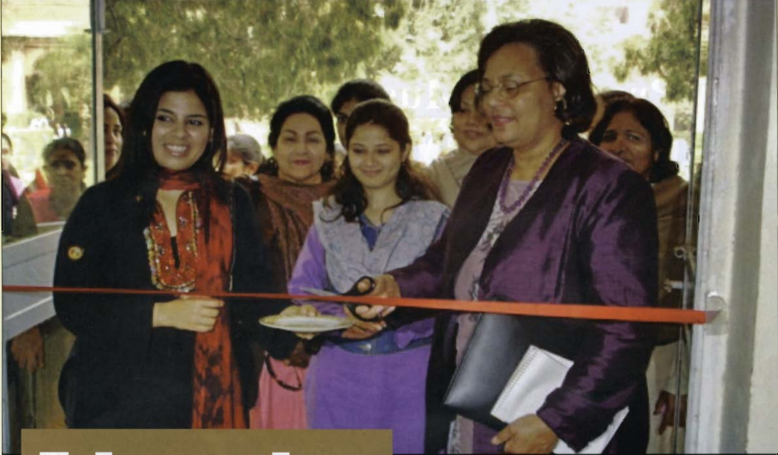
U.S. Diplomat Lyngrid Smith Rawlings opening an exhibit at the Kinnaird College highlighting various aspects of the Civil Rights Movement. The exhibit and Ms Rawlings' lecture were held in connection with the U.S. commemoration of the "Black History Month."