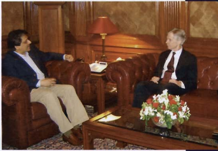
U.S. Ambassador Ryan C. Crocker meeting with the Sindh Governor, Dr. Ishrat-ul-Ibad, in Karachi on March 2.