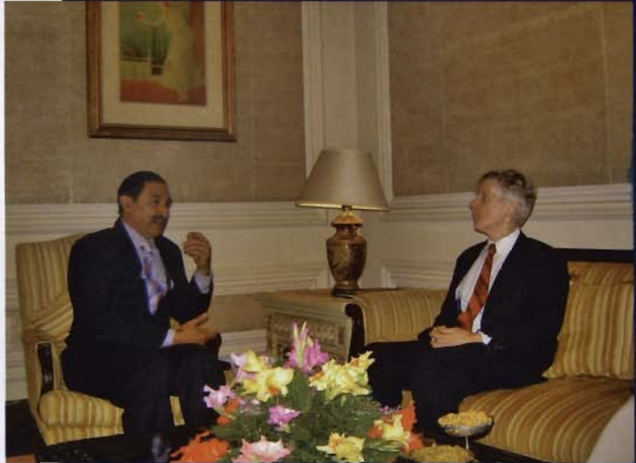
U.S. Ambassador Ryan C. Crocker meeting with the Punjab Governor, Lt. Gen. (ret'd), Khalid Maqbool, in Lahore on March 5.