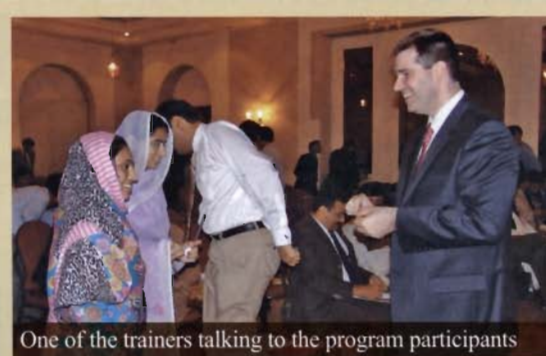
One of the trainers talking to the program participants