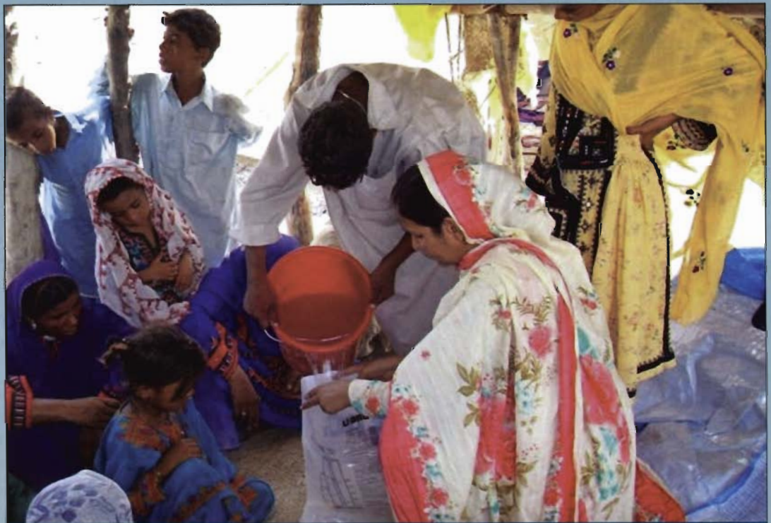
Potable water being provided to the flood victims by USAID in Kech District of Balochistan on August 13, 2007.

Through its emergency recovery program, CRS is helping 2,500 households (estimated 21,000 individuals) in Kech District by giv-